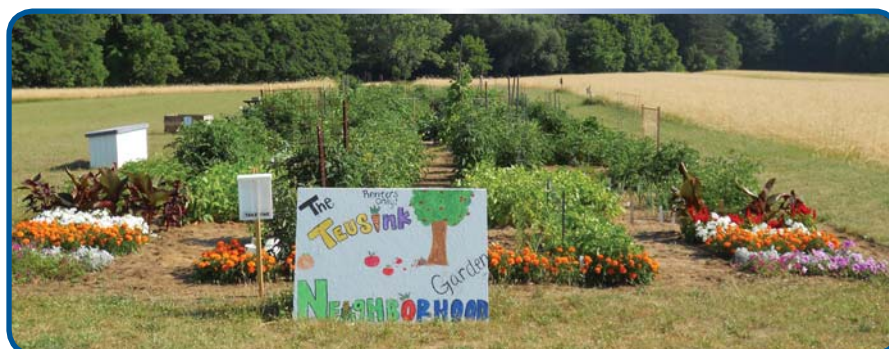
Neighborhood Connections Community Garden at Teusink's Farm.

Regularly walking the neighborhood; intentionally building relationships; mapping the neighborhood, identifying all potential assets (people, skills, associations, resources, businesses, churches etc.); surveying the neighborhood and listening to discover talents, key leaders and concerns; forming neighborhood action groups to connect assets with local concerns; implementing action plans, bringing in outside resources when appropriate; and self assessment of process and outcome.